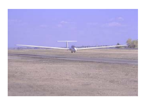
Two place sailplane landing.

You glide on to a landing. From 2,000' up (a typical tow release altitude), a sailplane can stay airborne some 10 minutes and travel some 10 miles in the process. With a little planning, it is not too hard to find an airport at which to land. If need be, any number of farm fields can be landed in safely as sailplanes touch down at 40 mph and roll 400', with little tendency to tip over like airplanes. Sailplanes grounded at a distant location are designed to be disassembled and loaded into trailers in a matter of minutes. Some wealthier pilots like to order small retractable "sustainer" engines installed in their machines, with just enough power and range to motor home. Still, having a trailer as part of one's kit provides a portable hangar for storage and a convenient means to relocate the glider at another site.