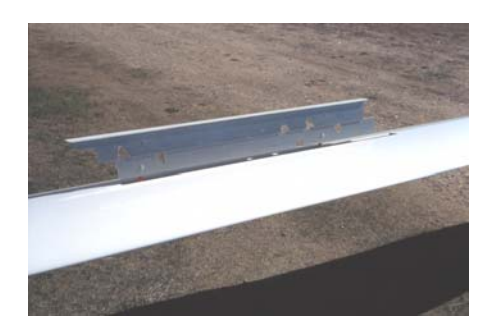
Spoilers come out of the wing and create drag for landing. Image by Bill Hoadley

With dedicated glidepath controls. Since the 1930s, when gliders were routinely becoming slippery sailplanes (glide ratio over 20:1), it has been standard practice to fit airframes with devices to decrease lift, increase drag, and steepen the glide. Most popular are wing top surface "spoilers", narrow blades that swing out perpendicular to the airflow, but various schemes of dive brakes, flaps, and even drag parachutes have been employed. With the continuously adjustable pull of a cockpit handle, a sailplane gliding at 60 mph and at a shallow 150 feet per minute (fpm) down (40:1) can be turned into a brick dropping at 1,500 fpm (4:1). Enough control to defeat storm currents and land exactly where desired.