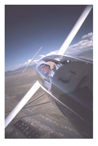
Flying free as a bird!

Typically, the same as for light airplanes. In the USA, the Federal Aviation Administration (FAA) sets certification requirements for gliders and their pilots, including annual equipment inspections and pilot currency checks. The NTSB and NASA maintain accident reports.