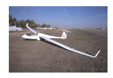
High performance Ventus 2b Sailplane after landing.

The newer category of Para-gliders consists of ram-air parachutes that omit rigid elements of hang-gliders (aluminum or carbon fiber tubes) and thereby score even higher on the light, portable, and cheap scales. However, these attributes